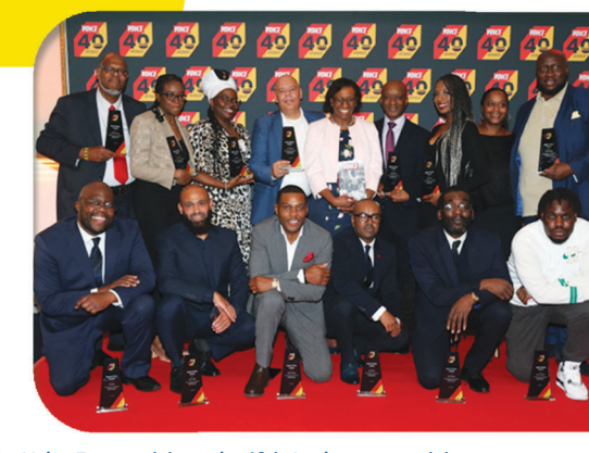
The Voice Team celebrate its 40th Anniversary and the launch of 40 years of Black British Lives which chronicles the history of Black Britons through the Voice Archives