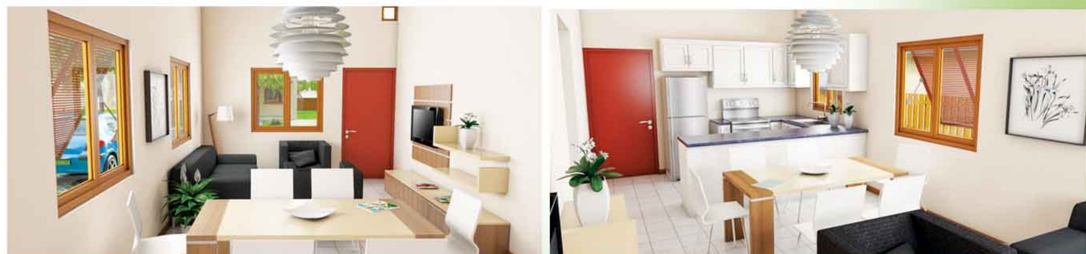
Single Family home, living & dining view Contemporary kitchen & dining design

Convenient location, adjacent to Greendale, St. Catherine near to public transportation, hospitals and schools.