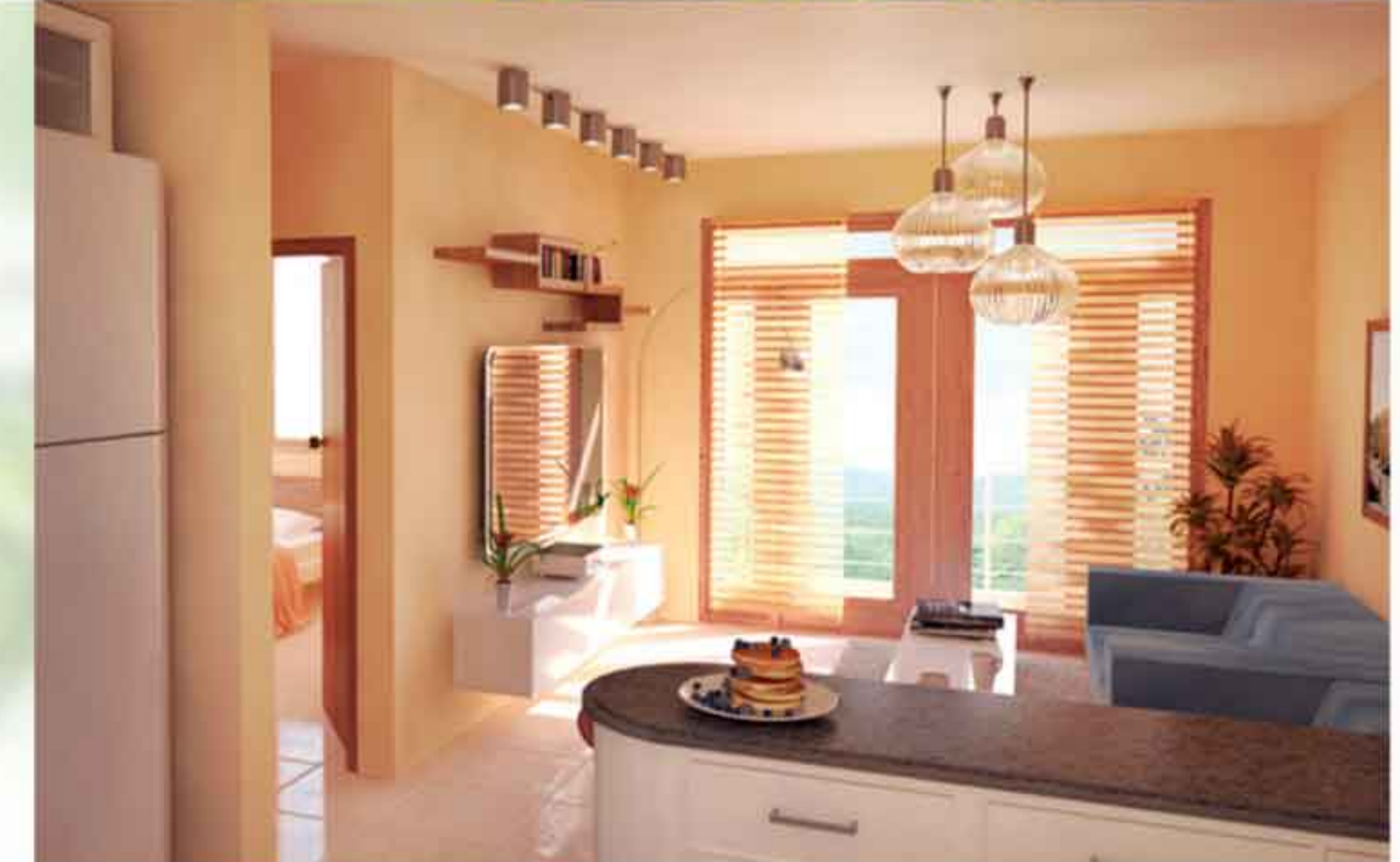
Apartment, 2 bd interior view Contemporary open kitchen & dining

•Swimming Pool •Clubhouse •BBQ & Green Area •Play Area