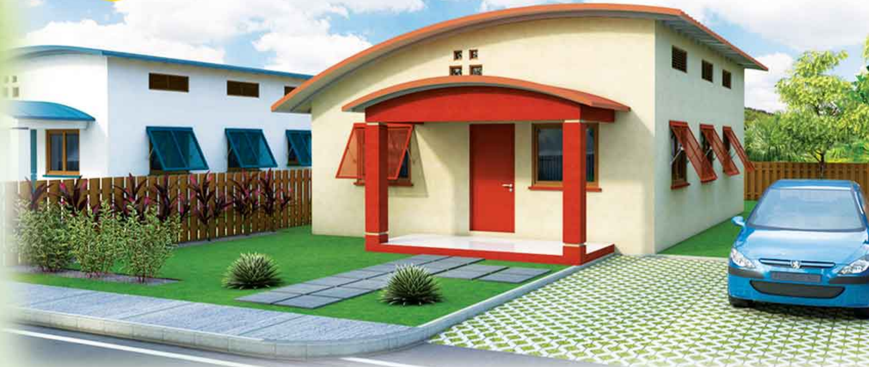
2 Bedroom starter unit with room for expansion