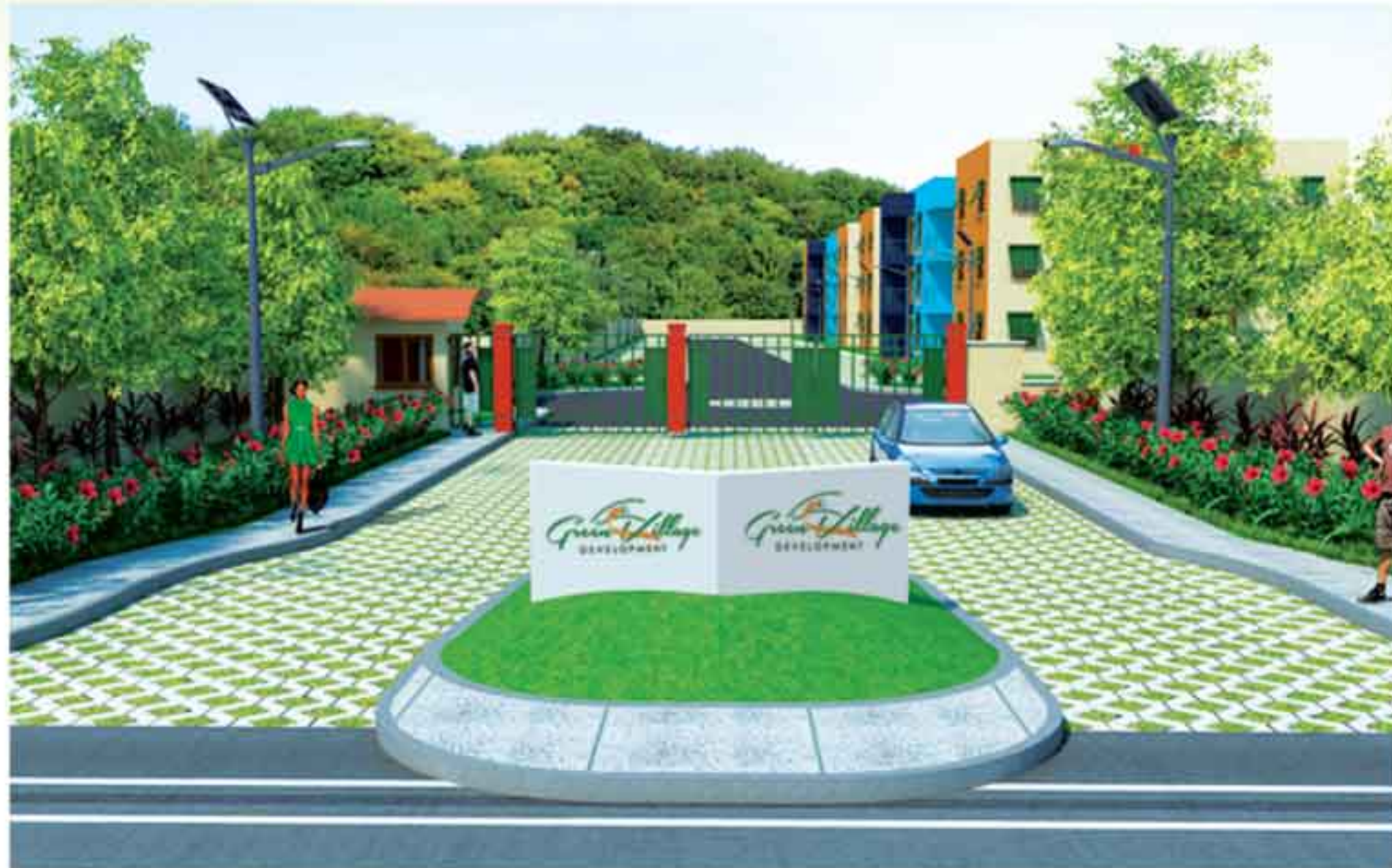
Secure Gated Community